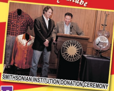
SMITHSONIAN INSTITUTION DONATION CEREMONY